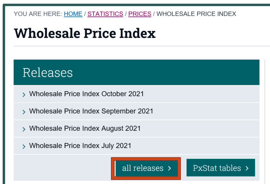
Figure 1: Select 'all releases' option.