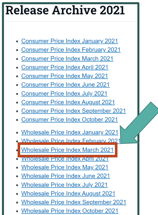
Figure 2: Select the Wholesale Price Index month you wish to view