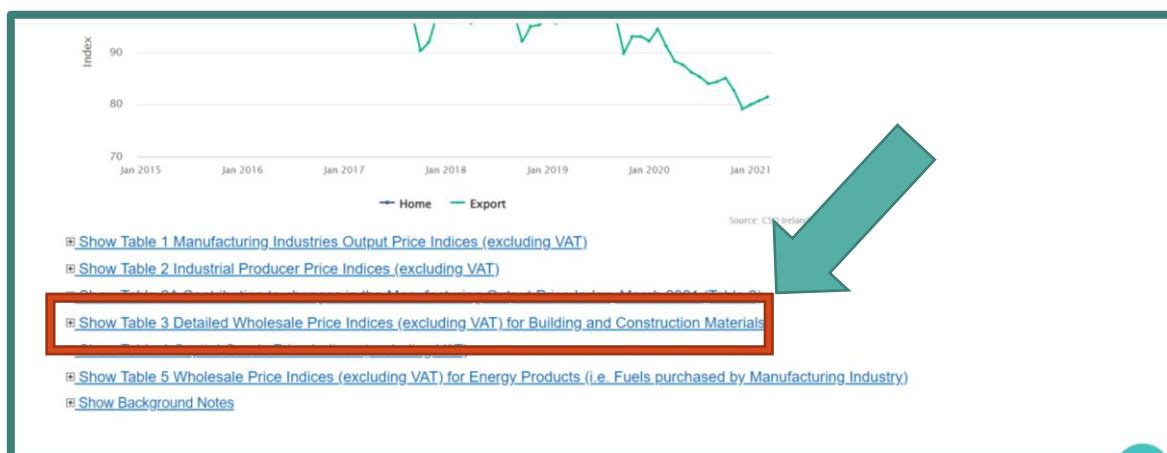
Figure 4: Select 'Show Table 3' to expand